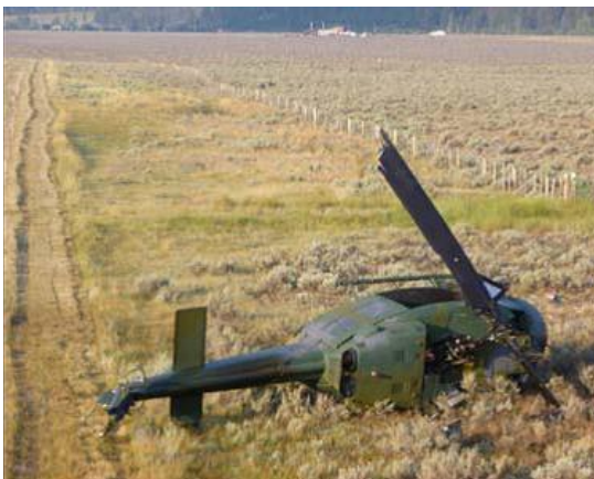
Damage to UH-1N after a hard landing at an unimproved landing strip.

The 341st Missile Wing located at Maelstrom Air Force Base, Great Falls (MT) reported a UH-1N sustained a “hard landing” on August 9, 2010 at an unimproved landing strip near Wise River (MT) during a rescue mission.