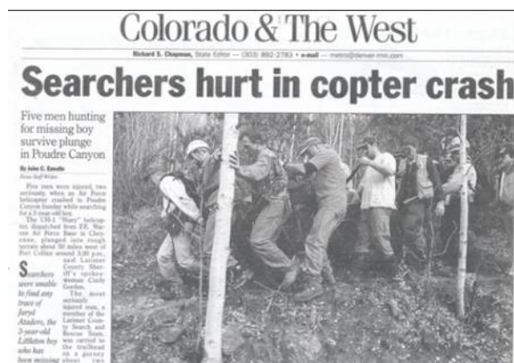
Headlines of the Denver Post describe a line of duty injury to a rescuer from Larimer County Search and Rescue.

The accident investigation board, convened by the AFSPC commander, Gen. Richard B. Myers, concluded the helicopter crash was caused primarily due to the mission pilots flying too low and too slow for the altitude, terrain, and winds/turbulence (sic). Once the aircraft began to sink, they did not have enough power, airspeed, or altitude to recover. xxiii