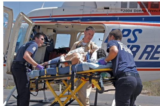
Arizona DPS Paramedic Bruce Harrolle (center) made the ultimate sacrifice while rescuing a couple near Sedona Arizona.

An Arizona Department of Public Safety (DPS) flight paramedic was killed during a helicopter rescue near Sedona, Arizona on October 13, 2008. 36 year-old Bruce Harrolle was struck by the main rotor blades during a rescue effort.