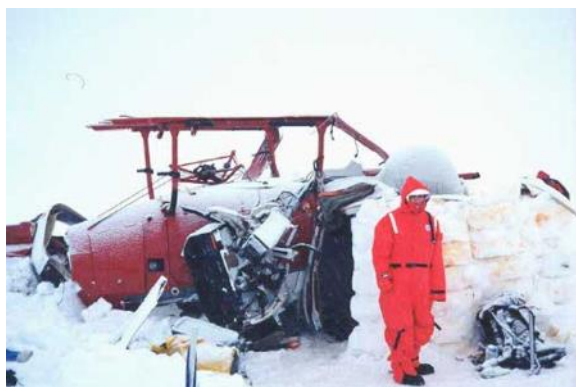
A survivor stands beside the igloo that she and fellow survivors built as an impromptu shelter.

The pilot had slowed the helicopter from 100 knots to 75 knots prior to striking the snow-covered ice field. Although the helicopter was destroyed on a 150-foot long wreckage path, the pilot and passengers all survived. The crash destroyed the ELT antennae, making the radio and ELT inoperable.