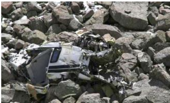
The crash site of the New Mexico State Police Agusta A-109E helicopter.

The NTSB report following this accident noted as contributory factors: