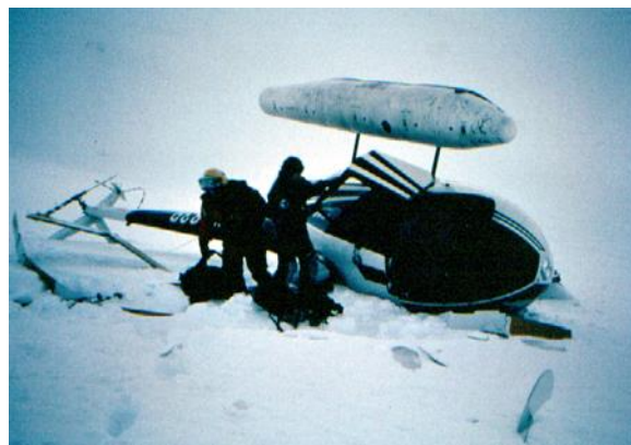
Doug Fessler, long time director of the Alaska Mountain Safety Center, stands beside the Alaska Fish and Wildlife helicopter that crashed in flat light with him on board.

noted that the wind was blowing about 10 knots from the east. xxv