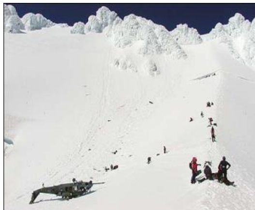
An Air Force Reserve Pavehawk helicopter lies at the bottom of a slope after crashing during a rescue effort.

its Blackhawk counterpart. This is due to an additional 185-gallon internal fuel tank, refueling system, and other communications equipment.