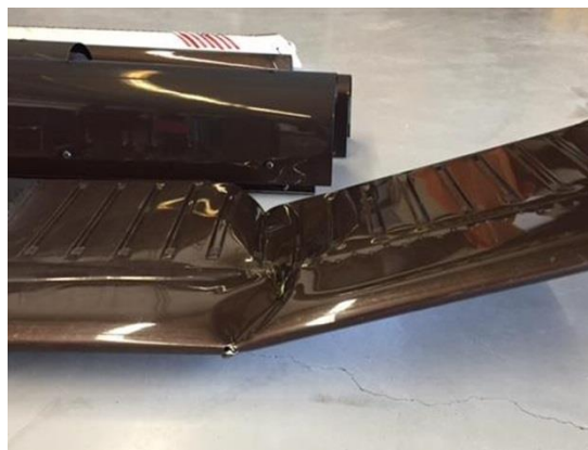
Horizontal Stabilizer damaged by impact with terrain during one-skid loading.

As the pilot maneuvered the right skid to make contact with the ground, the rescuers approached the helicopter to begin the loading process. The initial NTSB Accident/Incident Report indicated that, “Unknown to the pilot, one of the recovery team had secured himself to a rope that was anchored above the tip path plane of the helicopter.” While the rescuers approached the aircraft to load the litter, that rope – still attached to the terrain above – was pulled taught into the plane of the rotor disk, and was caught by the main rotor blade – ten inches from the blade tip. The subsequent pull of the rope by the main rotor resulted in a failure of the prusik connection point to the rescuer. The rope was then pulled rearward by the main rotor blade and made contact with the tail rotor. The rope then flew back uphill towards rescuers on the slope above.