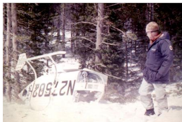
Former Mountain Rescue Association President J. Hunter Holloway stands beside the helicopter that crashed while he was aboard.

Less than an hour later, the Bell 206-B attempted to land in “an unauthorized L.Z.” As the helicopter was circling on final approach, it crashed into nearby trees. The helicopter suffered substantial damage as it landed on its side. Three of the four passengers were injured. The rescuer walked away from the scene. An Army Chinook helicopter, assisting in the search, landed near the crash site, and evacuated the four passengers.