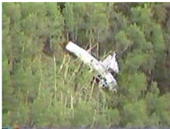
Pilot Terry Leadens died in the line of duty when his Civil Air Patrol single engine Cessna crashed during a search for a missing hiker.

distance from the first tree strike to the main wreckage was 62 feet. The aircraft came to a rest on its nose. The terrain elevation was about 10,600 feet MSL. ix