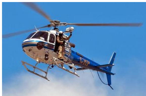
California High Patrol AS 350 B3 Helicopter