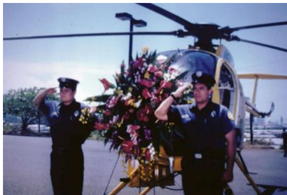
Honolulu Fire Department officials pay respect to their three colleagues who died in the line of duty.