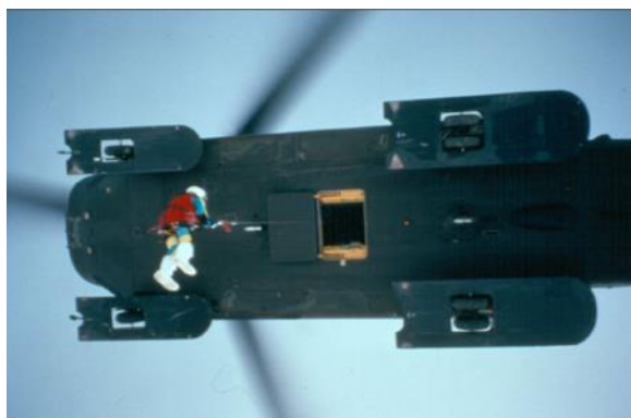
A hoist operation through the "Hell Hole" of a Chinook helicopter.

In the middle of the lowering, high winds forced the crew to reverse the winch in an attempt to raise Givler back into the helicopter. During the raising, the combination of the backpack and horse-collar pinched a nerve in Givler's upper body, causing him to lose all sensation in his arms. Just as rescuers on board the helicopter began to pull Givler aboard, he slipped from the horse collar and fell from the helicopter.