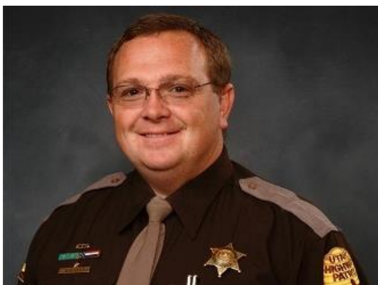
Utah Highway Patrol trooper Aaron Beesley died while performing a rescue of two stranded hikers.

In a hot load situation, Beesley helped the teens on board the AS350-B2. The pilot exited the scene with the plan to transport the hikers to safety and return for Trooper Beesley. When the pilot returned, Beesley could not be located. It took the helicopter crew 45 minutes to find his body beneath a 90-foot cliff.